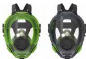
Full face masks BLS 5700 - BLS 5600