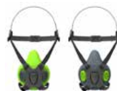
Half maks BLS 4000 S - BLS 4000 R